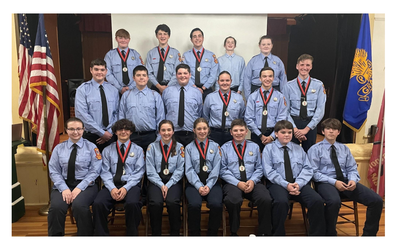
2022 Awards Banquet

It's been a while since we have been able to put out a publication. So please view the latest youtube video to see what we have been up over the course of the last year: https://youtu.be/OGe8cSXGBLE • 2022 Fire Explorer Year